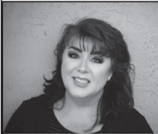
Realty World Golden Hills