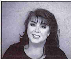
Realty World Golden Hills

Buy or Sell your home with me & Five Wounds Church will get 25% of my commission on your behalf.