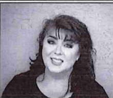
Realty World Golden Hills