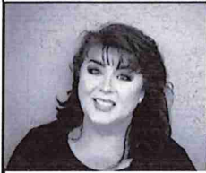
Realty World Golden Hills