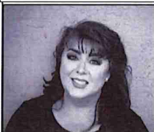
Realty World Golden Hills

Buy or Sell your home with me & Five Wounds Church will get 25% of my commission on your behalf.