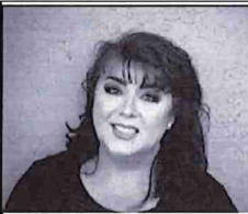
Realty World Golden Hills

Buy or Sell your home with me & Five Wounds Church will get 25% of my commission on your behalf.