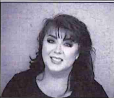
Realty World Golden Hills

Buy or Sell your home with me & Five Wounds Church will get 25% of my commission on your behalf.